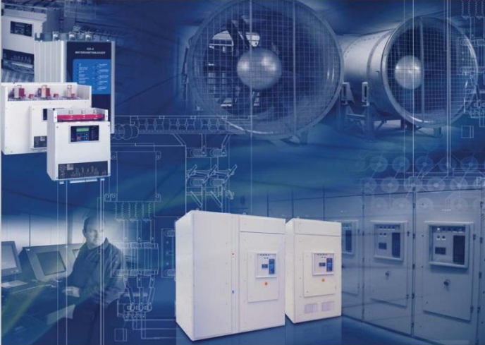
Voltage Range 220 – 15 000 V | Current Range 1 – 3 500 A